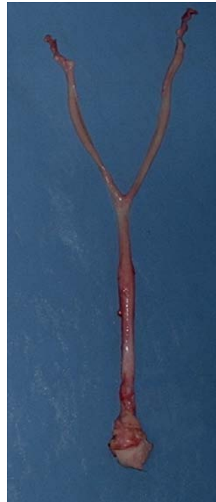
750 ppb ZEA + MYCO-AD A-Z