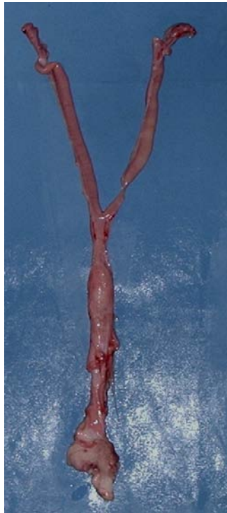
750 ppb ZEA