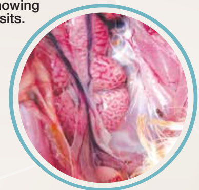
Kidneys showing urate deposits.